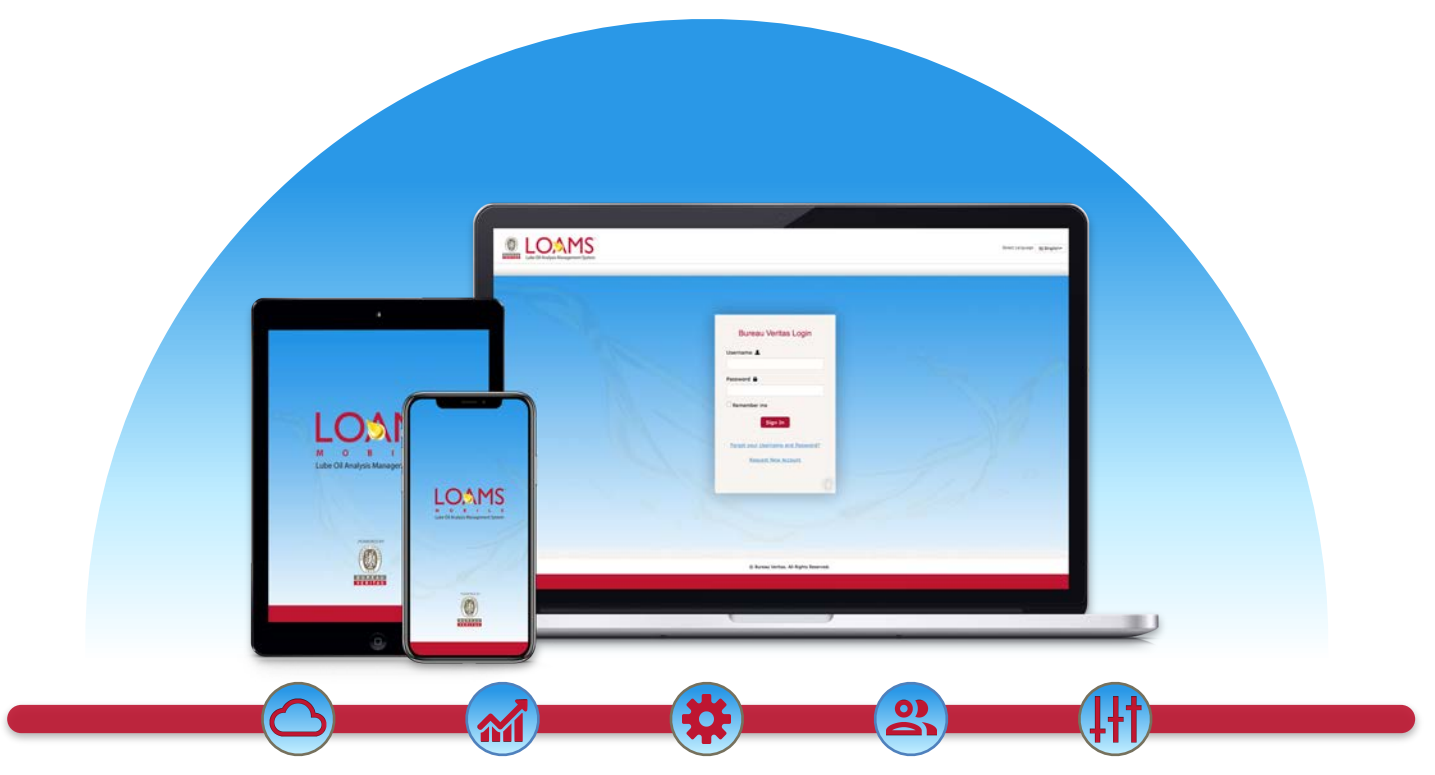
LOAMS — The Lube Oil Analysis Management System — by Bureau Veritas gives you access to real-time oil analysis data from your computer, tablet or mobile device. LOAMS is: